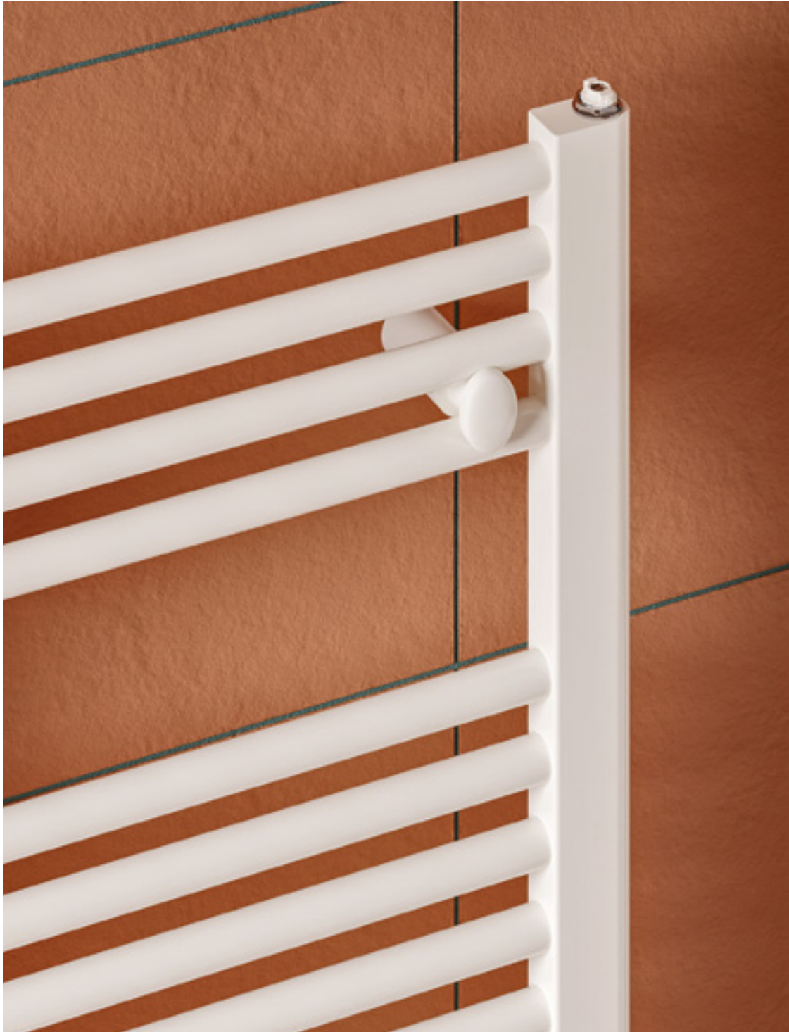
ARES height 1462 mm, length 530 mm. Standard White finish (cod. 01).